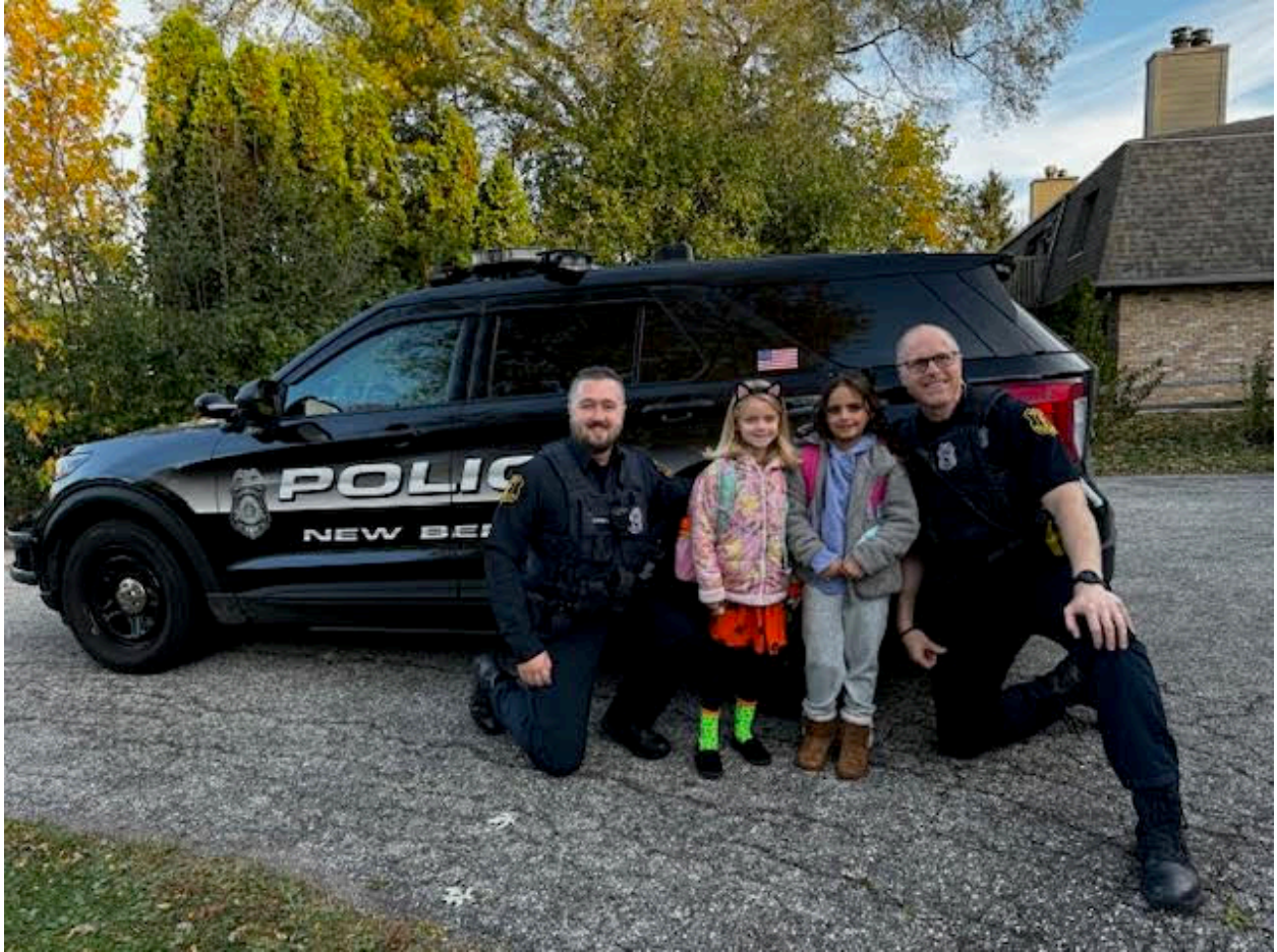
First Graders Enjoying their Fall Celebrations!